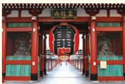
⑧ Tokyo (Senso-ji)