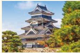
① Matsumoto Castle

If you want to make the most of your trip in Eastern Japan, we recommend a visit to the Nagano and Niigata areas. Both are relatively close to Tokyo and offer a wide variety of sightseeing spots, including leisure facilities such as hot springs and ski resorts – all surrounded by stunning views.